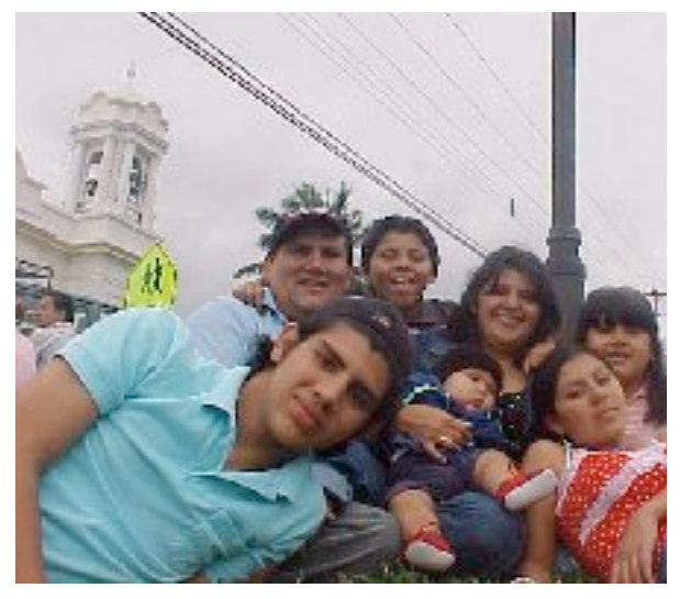
RIGOS' FAMILY INCLUDING GRANDSON