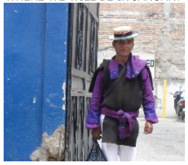
TYPICAL DRESS FOR ONE OF 22 MAYAN RAZAS IN GUATEMALA